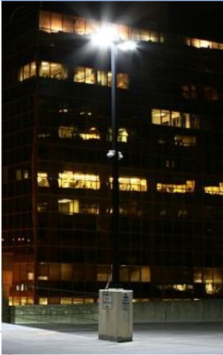
The Double SL-50 provides effective lighting in garage applications on the upper deck of the structure.